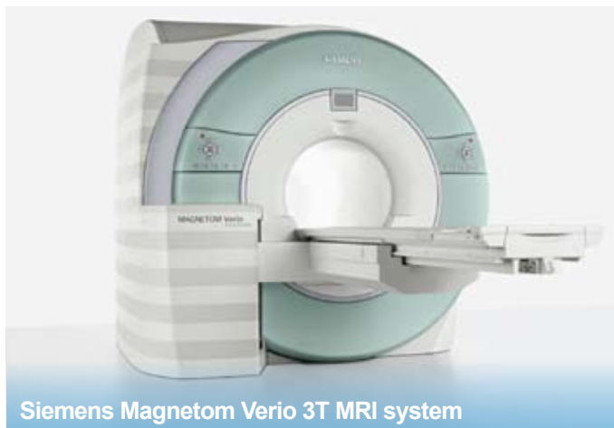
Siemens Magnetom Verio 3T MRI system

We are taking delivery of a second MRI scanner at Russells Hall Hospital to offer patients faster quality imaging, more accurate diagnoses and shorter waiting times.